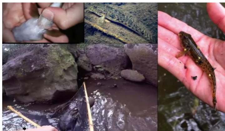
Recorded Hālaū Kū Māna virtual field trip, April 2020.

Saint Louis School site , Pālolo Stream Ānuenue School site , Pālolo Stream Hālaū Kū Māna study site , Makiki Stream Washington Middle School, Makiki Stream